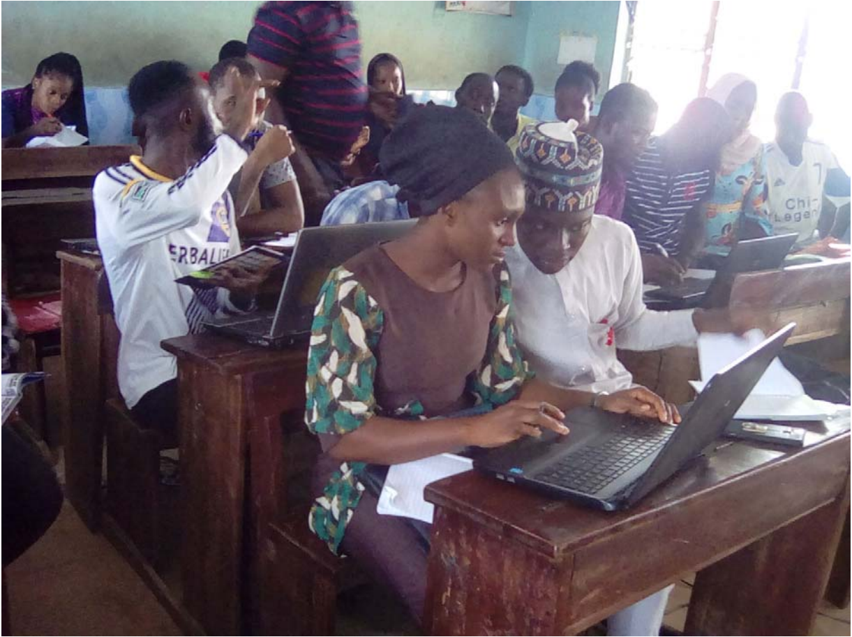
The training had 31 participants where 14 participants are Female while 17 participants are Male